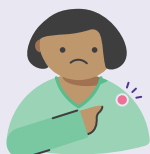
Arm is sore or red at the injection site

Side effects are common. Here's what to look out for.